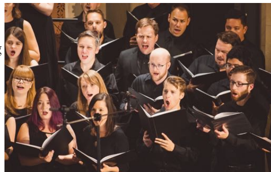
Young Professionals' Choral Collective